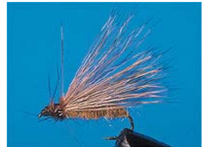
Autumn Haw Knob Caddis