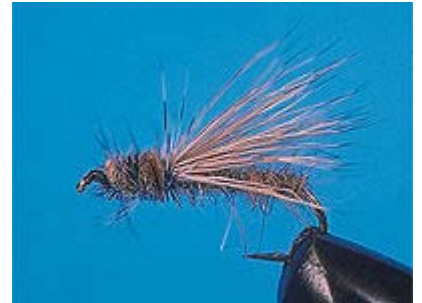
Fluttering Stone Hare